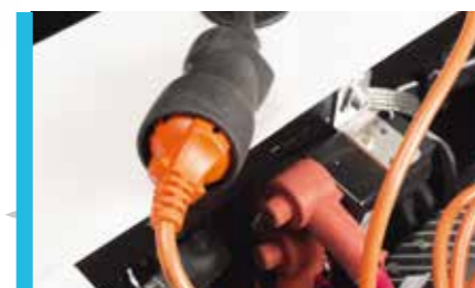
Charges on domestic socket