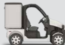
PULSE 4 - SHORT