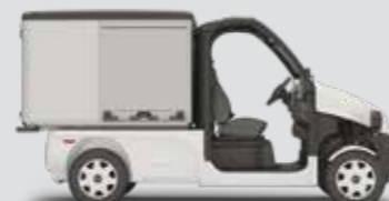
PULSE 4 - LONG