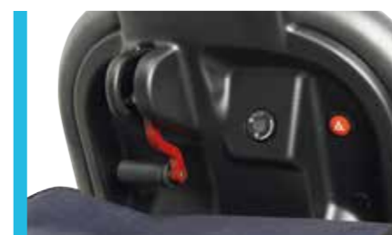
Parking brake with pendular blocking