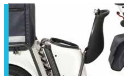
Double 5V 1A USB socket under the seat