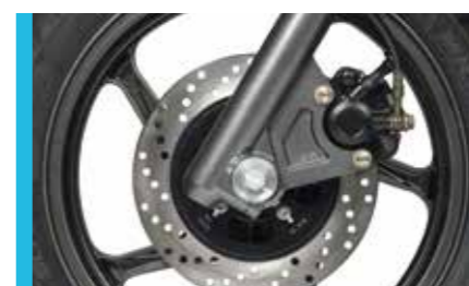
3 ventilated hydraulic disk brakes